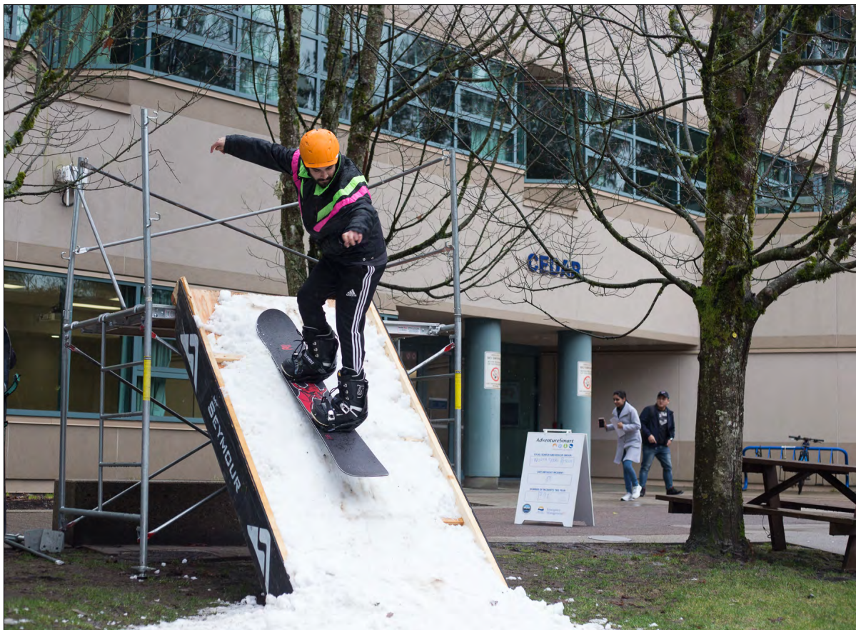
The Uncapped Rail Jam, now in its sixth year, continues to attract crowds as well as skiers and snowboarders.