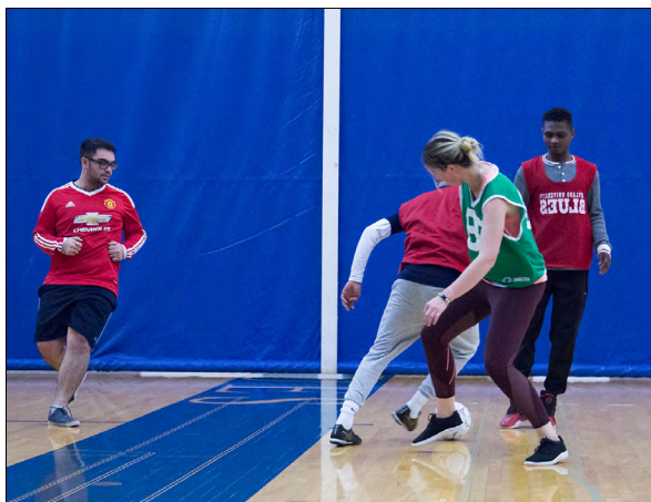
Fees approved in last year's referendums have allowed for the organization of regular recreation-based events including indoor soccer and badminton.